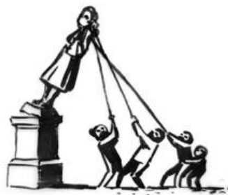
Banksy, Instagram , 2020

Examine Banksy's proposal for what to do with Colston's statue (picture below). What do you think governments should do about monuments representing painful periods of history?